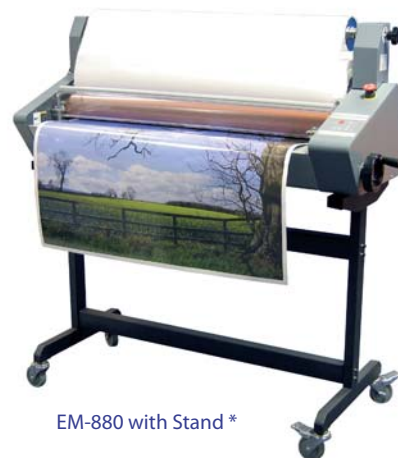
EM-880 with Stand *