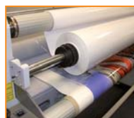
MOTORISED TAKE UP UNIT*