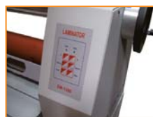
USER FRIENDLY CONTROL PANEL