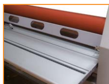
LARGE SWING OUT FEED TRAY