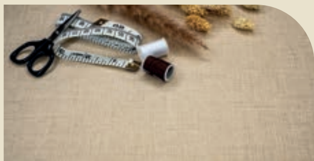
Textile NATURAL - NATURAL METALLIC - LEATHER