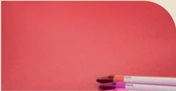
Color ESSENTIAL - SILK - SILK