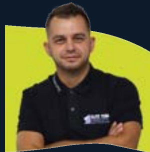
SENAD MUSIC Cover Styl Trainer