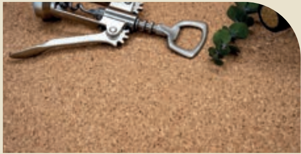
Wood CORK - PAINTED - PAINTED LIGHT - MEDIUM - DARK